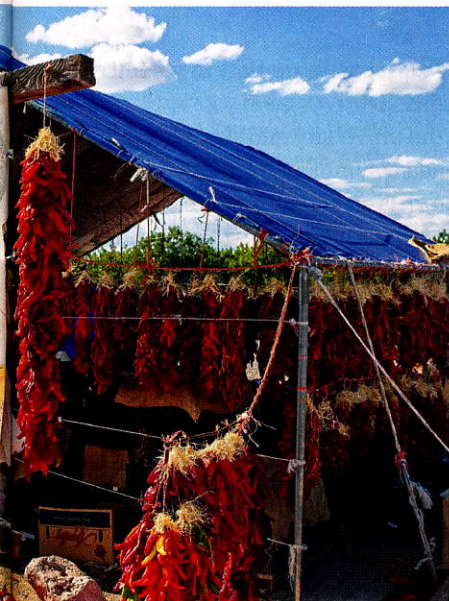
Clockwise from above: A vendor sells decorative ristras made with red chiles; chiles roast in a mesh cylinder; and fresh peppers are sold at farmers markets all over New Mexico, including Albuquerque's Downtown Growers' Market.